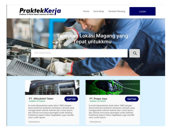
Figure 1. Practice Platform Industry based on Work-Based Learning

This research involved automotive engineering education students at Universitas Muhammadiyah Purworejo as respondents. Work-based industry practice platform-based learning that has been developed is validated in advance by material experts and media experts, for this research, the validators are from academic lecturers, vocational education experts, and practitioners of the automotive industry.